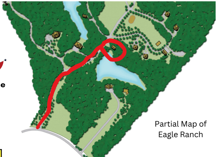
Partial Map of Eagle Ranch

Please note the July meeting is on the second Monday, July 10. Have a Happy July 4th!